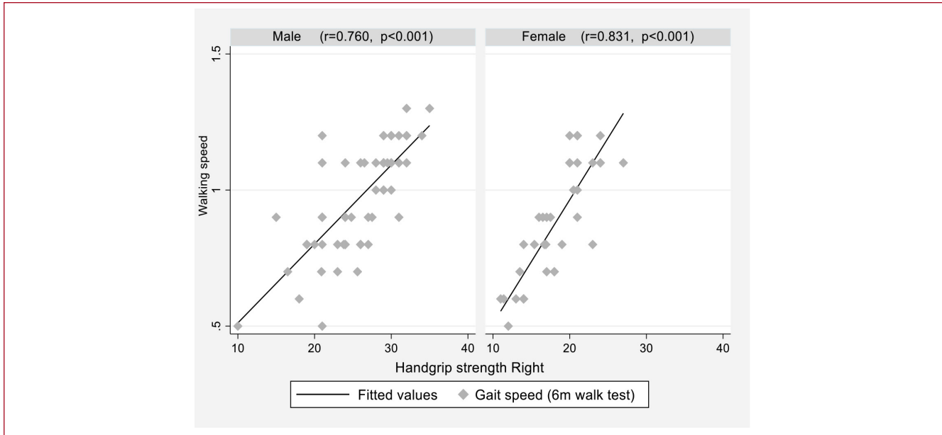
Figure 1. Scatter plot between handgrip strength and walking speed.